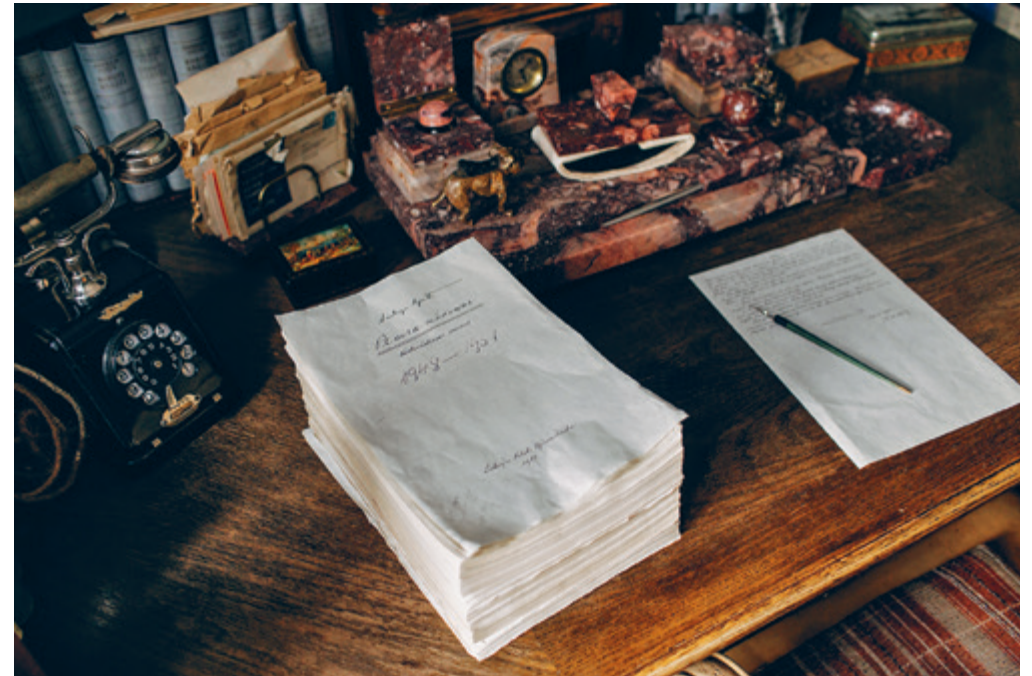
Writing desk in Andrejs Upītis museum, Rīga, Brīvības str.

On the street, I saw several people who walked past as if they didn't know me.