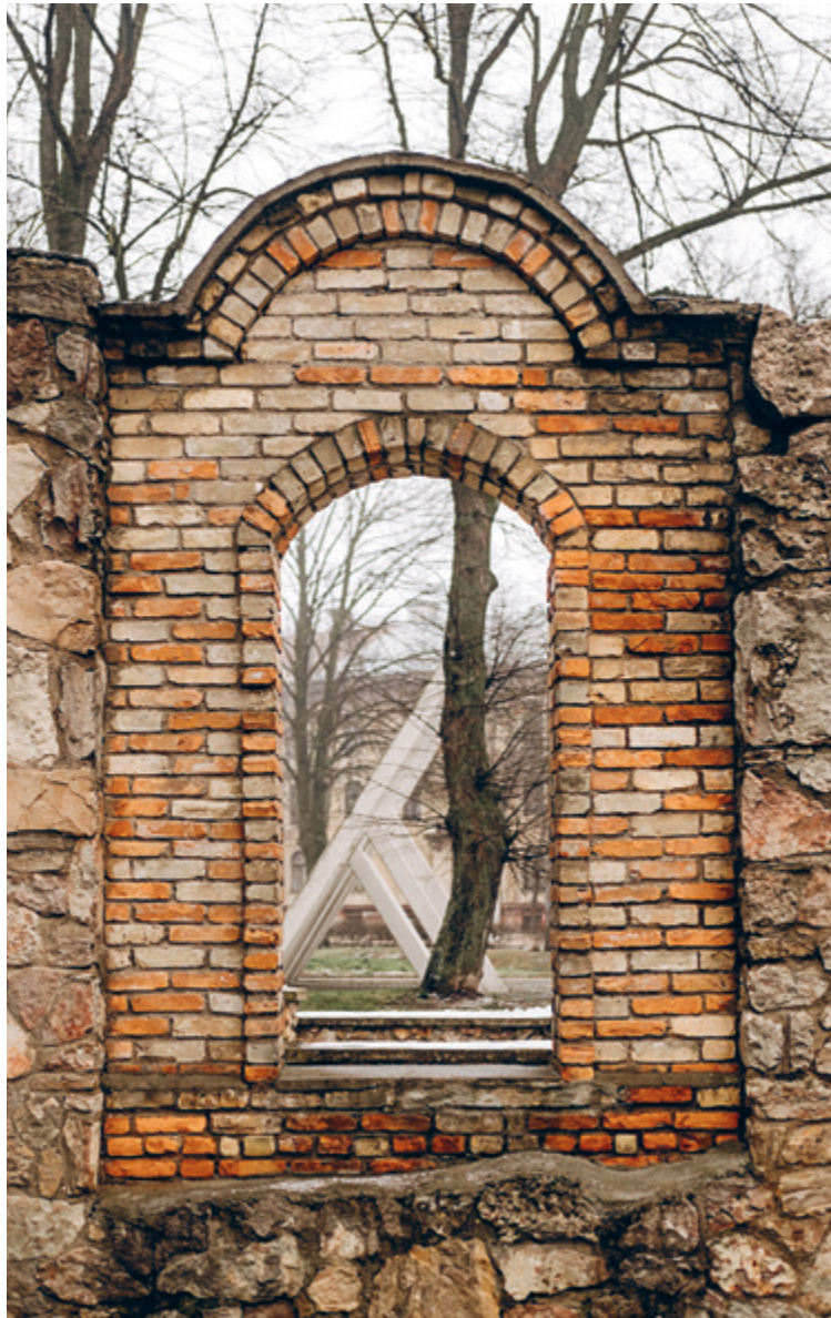
Ruins of The Great Choral Synagogue on Gogol street in Riga