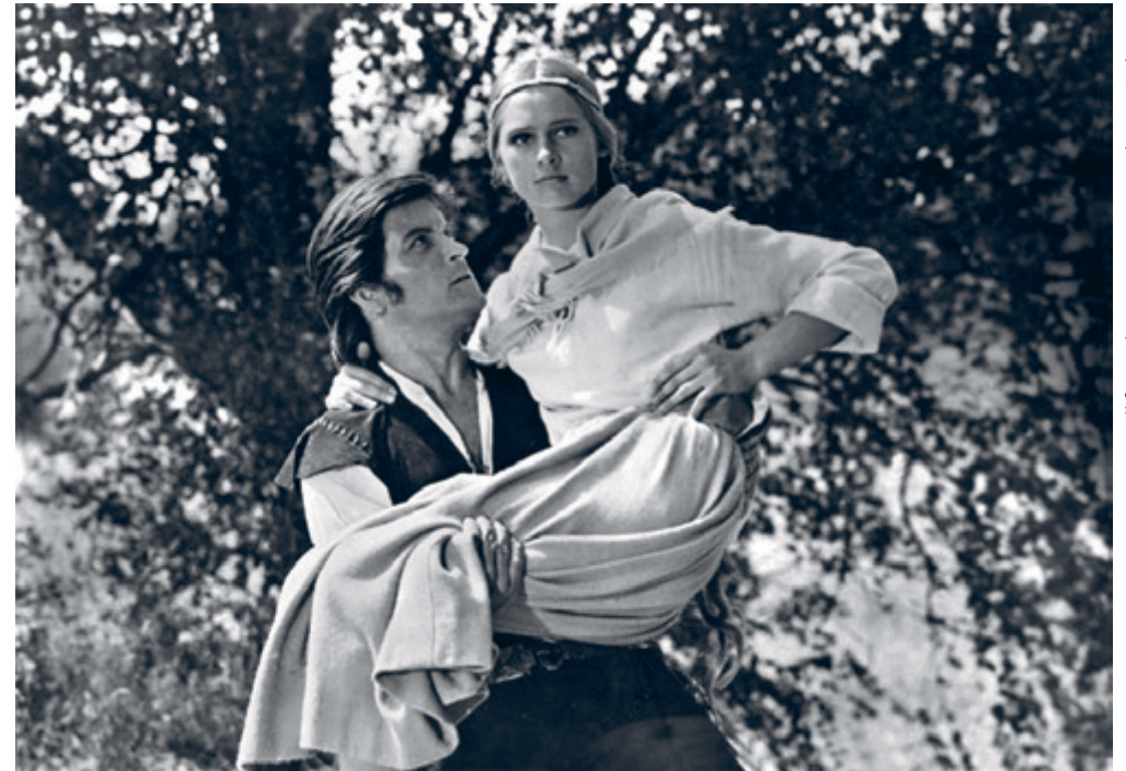
Still from the motion picture Blow, the Wind! , 1973

You know, I think there's a great deal of truth in them. Other country's fairy tales don't always end as happily as they do in our country. Terrible things happen in Breton fairy tales. There's a great deal of truth is encoded in them. And that miraculous thing? I think that to a certain extent, it also exists in life. Just in a different material. There are things to believe in there.