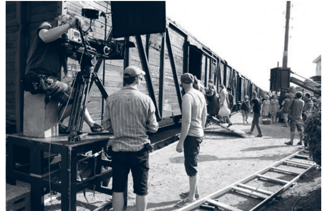
During the filming of “Chronicles of Melania”

people who had lost all hope and direction.