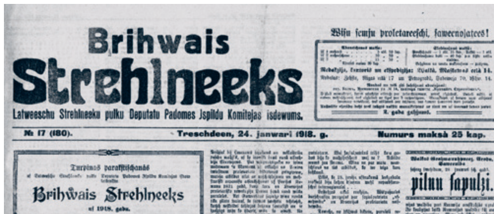
Newspaper “Brīvais Strēlnieks”, January 1918