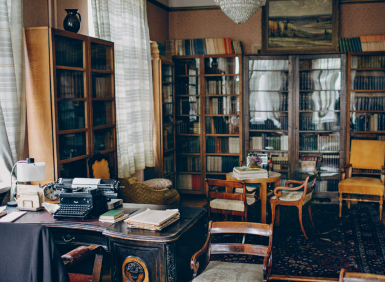
Andrejs Upītis museum, Rīga, Brīvības str.